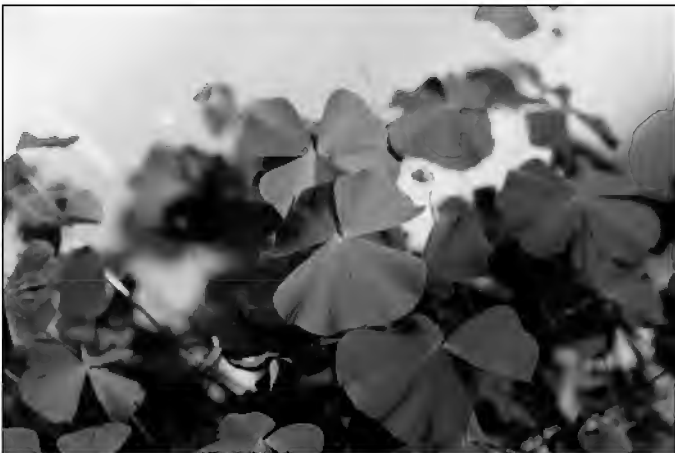
DNA “fingerprint” analysis was used to clarify the endemism of this water clover fern ( Marsilea ) which was previously considered introduced in central Florida.

Under a research grant from the South Florida Water Management District, the agency that oversees water resources in the southern half of Florida, we are using seed storage and greenhouse regeneration trials to understand the early life history processes crucial to the establishment and persistence of Tropical American watergrass ( Luziola subintegra ). Although Neotropical in origin, the endemic distribution of this “rice-related” species is not clear because, based on botanical records, it has moved significantly in recent decades in the greater Caribbean Basin. Since its 2007 discovery in Florida, and despite a concerted regimen of herbicide treatment, Tropical American watergrass has spread in Lake Okeechobee, and invaded a restoration wetland on the eastern margin of Everglades National Park. We are learning how hydrology interacts with seed survival in the soil and with seedling regeneration in the colonization of new sites. At the same time we are identifying and monitoring the response of associated plant species at the Everglades site, in order to better guide restoration processes. These applied studies focused on providing immediate information needed by land managers to accurately predict population dynamics in conjunction with their ongoing herbicide applications for management purposes.